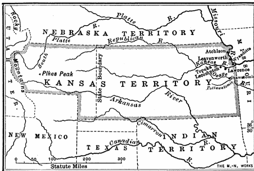
Early Map Of The Kansas Territory Showing Towns Huddled Along the Missouri Border