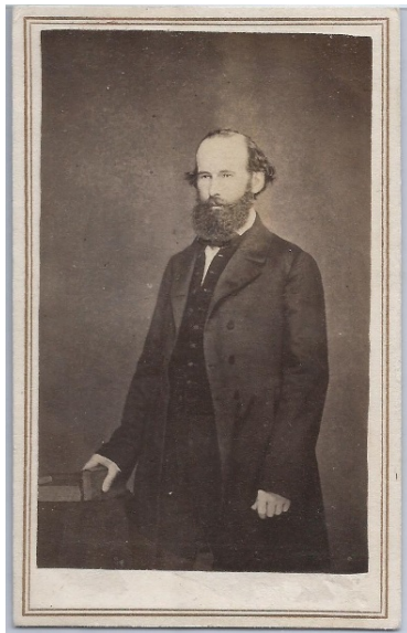
Eli Thayer (1819-1899)

As soon as it appears that Kansas will become a state, one Eli Thayer of Worcester, Massachusetts, formulates a plan to transport settlers there in order to open new towns, built on the virtues of free labor and capitalism.