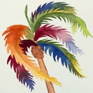
Palm City Art Associates