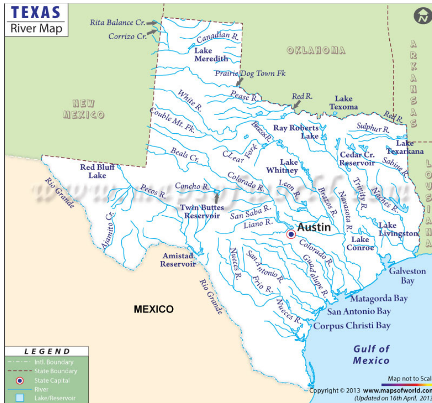
The Disputed Province of Tejas/Texas

After this difference stalls progress, Adams takes a hard-nosed stance, essentially an ultimatum, “giving” on the Rio Grande proposal, while demanding a line that goes north along the Mississippi, then west on the Sabine and Red Rivers, then north again to the Arkansas, followed by another northward turn to the 42 nd parallel and all the way from there to the west coast.