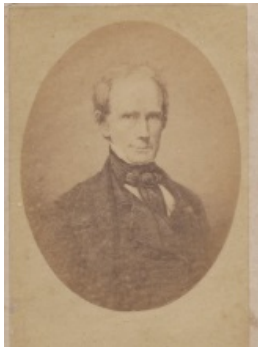
Henry Clay (1777-1852)

Clay regards Jackson's executions at St. Marks and his seizure of Pensacola as "acts of war," carried out in rogue fashion by the General without authorization from Congress, as required in the Constitution.