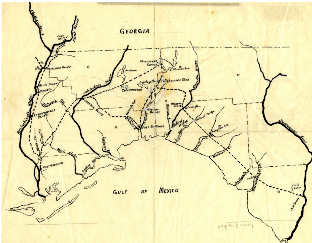
Map of General Andrew Jackson's Florida Incursion in 1818 from the Apalachicola (left) to the Suwannee Rivers (right)

General Jackson of course has won national fame during the War of 1812 with his landmark victories at Horseshoe Bend and New Orleans, so he is well accustomed to leading troops into action.