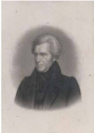
Andrew Jackson (1767-1845)

This ends Jackson's ten-week rampage across northern Florida.