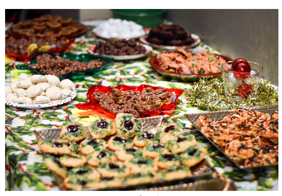
Memories of cookies past.

Remember to use AMAZON SMILE smile.amazon.com (look for Soroptimist International of Grosse Pointe)