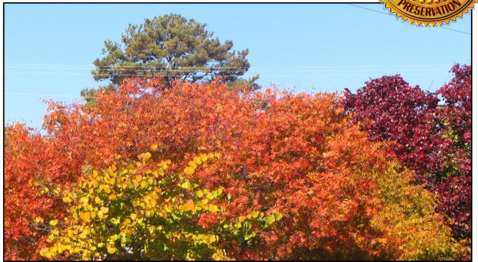
The splendour of Autumn in Trails