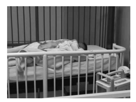
Cruzando fronteras para ayudar a niños minusvalidos de México

After surgery, each patient had a special blanket waiting on the recovery room bed. Generous volunteers made the blankets for the children.