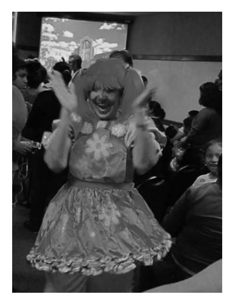
group of ladies from all walks of life who give of their time free of charge at CIMA Hospital. They also raise money for CIMA patients who cannot afford hospital care.

In October, staff members and volunteers journeyed once again to Hermosillo for the Annual Cleft Palate/Cleft Lip Mission. Medical staff from Children's Surgery International of Minneapolis flew in to perform the surgeries at CIMA Hospital, a first-rate hospital in Hermosillo. The CIMA Voluntariado had everything organized and facilitated each day's work. They even entertained the children during the long day's wait. The Voluntariado are a