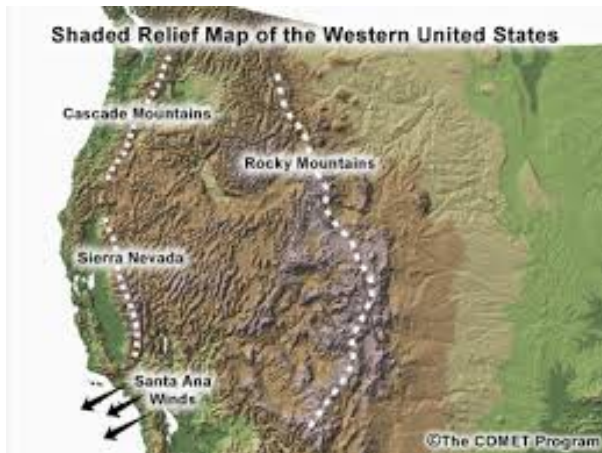
Map Of The Sierra Nevada Range Heading South

decides to swing south, heading along the eastern face of the Sierra Nevada range toward Sacramento, California. It is a decision which almost proves fatal.