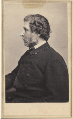
John Fremont (1813-1890)

In reality, casting Fremont as the “Great Pathfinder” is more the product of publicity than performance – since almost all of the trails he takes have been “blazed” by many others before him.