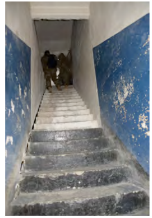
After Above: stair treads & space above retain all historic fabric and character