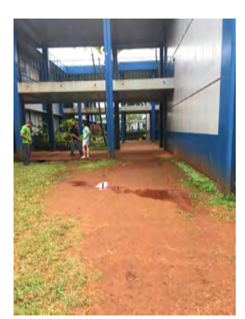
Before: Red clay dirt/mud at entrance

project New Construction: Improved Access objectives Military-to-Civilian Career Training, Operational Need team Active Duty Military Service Members completed Spring 2017 owner U.S. Army location Wheeler Army Air Field, Wahiawa, Hawaii