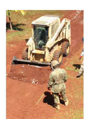
In Progress: Site preparation