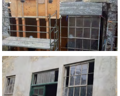
Top: Exterior front façade in progress; Bottom: Exterior front façade repairs completed, prior to painting