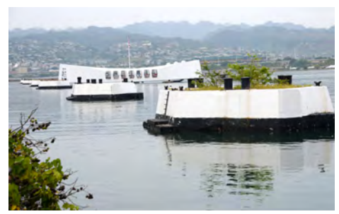
Battleship Row Fleet Moorings

project Structural Repair: Infrastructure objectives Military-to-Civilian Career Training, Historic Preservation, Infrastructure Advancement team Active Duty Military Service Members completed Ongoing owner National Park Service location Pearl Harbor National Monument, Oahu, Hawaii