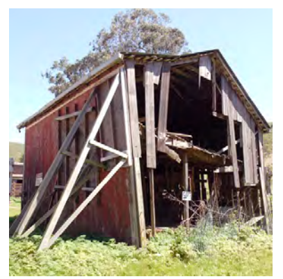
Before: Existing conditions, building rear

project Structural Building Repair, Seismic Stabilization objectives College Student Field Training, Historic Preservation, Owner Operational Need team College Students & Community Volunteers completed 2011-12 owner National Park Service location Miwok Riding Stables, Golden Gate National Recreation Area, San Francisco, California