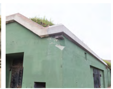
After: Repairs complete