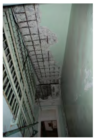
Before: extensive concrete deterioration & steel corrosion, unsafe conditions

project Structural Building Repair objectives Military-to-Civilian Career Training, Historic Preservation, Increase Safe Access team Military Veterans, College Students completed Summer 2015 owner National Park Service location Alcatraz Island, San Francisco, California