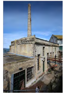
Before: Power House

Project Structural Building Repair objectives Military-to-Civilian & Student Career Training, Historic Preservation, Increase Safe Access team Military Veterans, College Students completed Summer 2013 owner National Park Service location Alcatraz Island, Golden Gate National Recreation Area, San Francisco, California