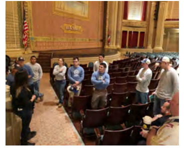
CPI active duty military team discussing project with clients