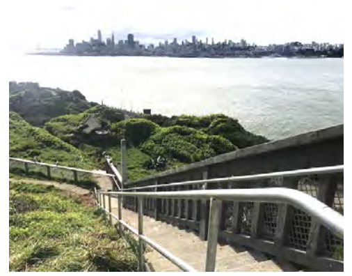
After: Area now accessible for visitors