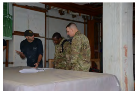
CPI military veteran participant explaining project during visit from U.S. Army chain of command