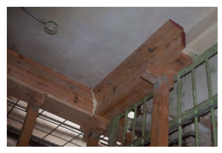
Beam formwork; new beams support repaired landing at top of stairs