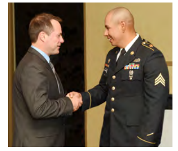
CPI team member nearing civilian transition greeting potential industry employer