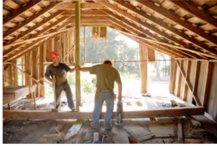
Straightening the structural frame after barn lifted off foundation