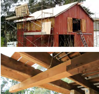
In Progress Top: New roof installation; Bottom: Splicing new wood members to historic