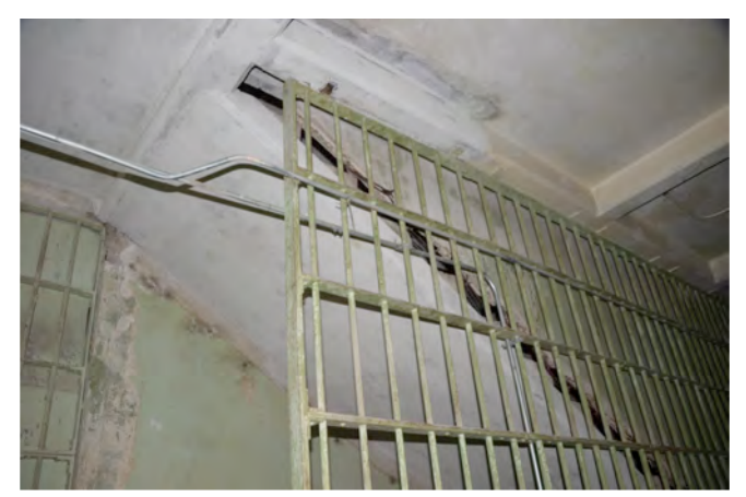
After Below: all repairs completed from below to retain historic fabric above