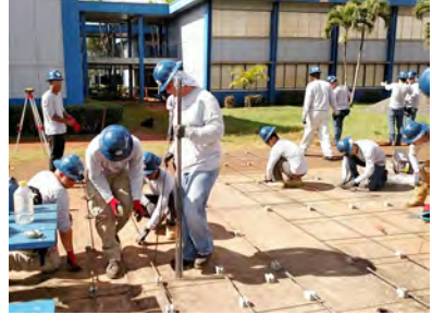
Reinforcing steel placement