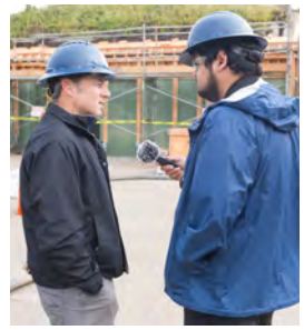
CPI team member interviewed by press during project