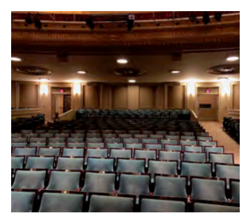
Repaired door surrounds at back of theater