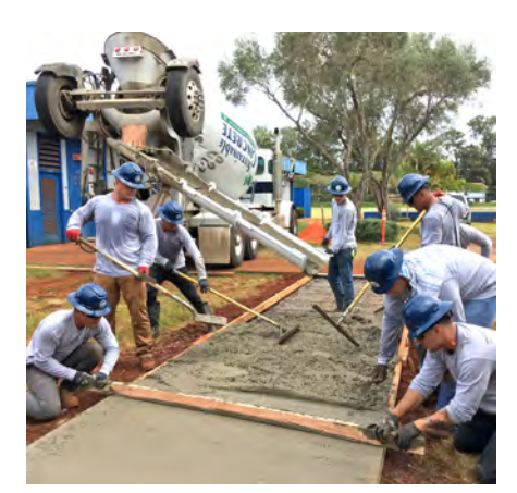
In Progress: Placing concrete