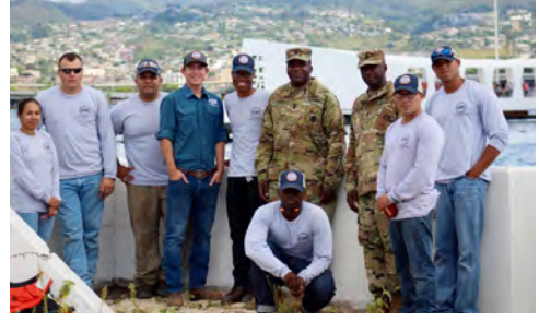
CPI active duty military team with visiting military leadership on Fleet Mooring, USS Arizona memorial in background