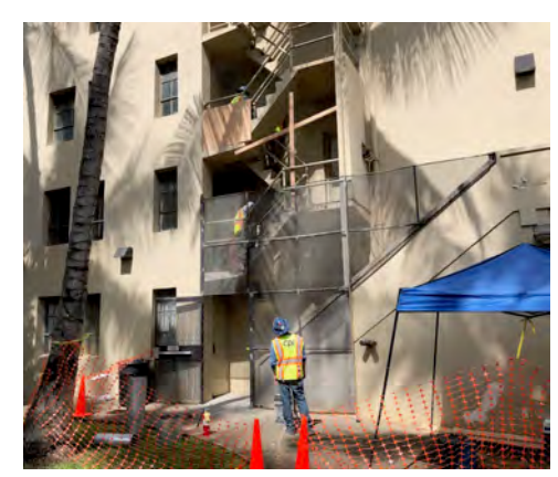
In Progress: work at exterior of building with CPI team and public safety barriers in place

project Structural Building Repair objectives Military-to-Civilian Career Training, Historic Preservation, Community Service team Active Duty Military Service Members completed Spring 2019 owner Hawaii Theater Center location Honolulu, Hawaii