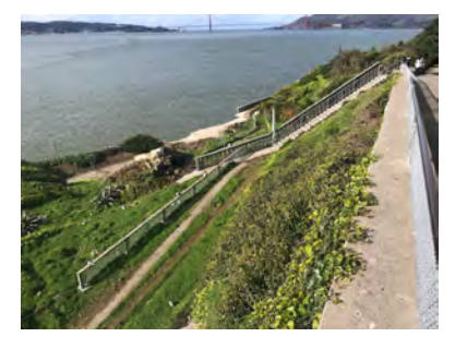
Completed project open to the public

Installing welded wire mesh for visitor safety