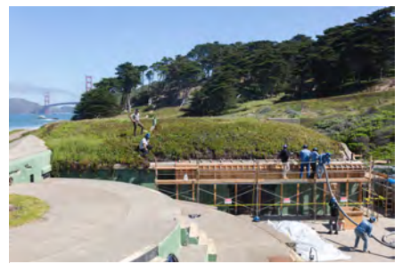
Work site; Golden Gate Bridge in background