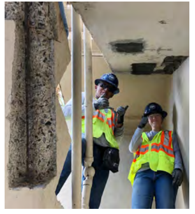
In Progress: column and soffit repairs