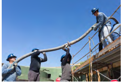
Concrete from ready mix truck delivered through pump and hoses; all hands on deck to manage hoses heavy with concrete