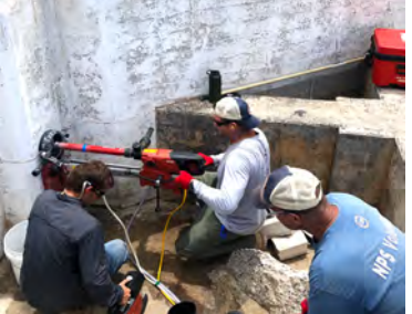
Horizontal core drilling for

Vertical core drilling for material material testing testing