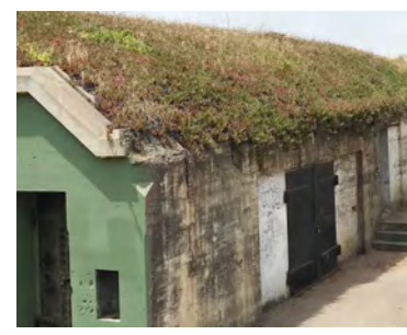
Before: Deteriorated condition, visitor safety compromised

project Structural Building Repair objectives Military-to-Civilian Career Training, Advanced Technology for Historic Preservation team Active Duty Military Service Members completed Fall 2018 & Spring 2019 owner National Park Service location Golden Gate National Recreation Area, San Francisco, California