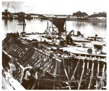
Fleet Mooring historic construction photo