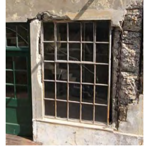
Historic window/deteriorated concrete