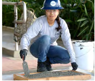
Active duty military CPI team member