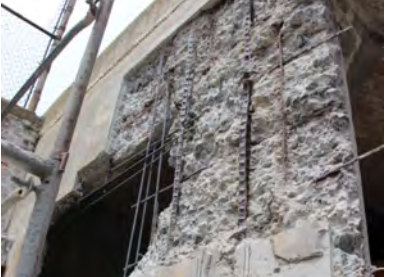
Deteriorated concrete removed, reinforcing steel cleaned/new steel installed

Historic window removed during construction