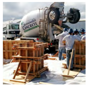
Pre-project formwork and ready-mix concrete training