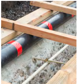
Composite bars & drainage pipe prior to being embedded in concrete