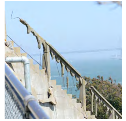
Before: Deteriorated conditions, no visitor access

project Site Feature Repair objectives Military-to-Civilian Career Training, Historic Preservation, Visitor Access to Closed Area team Military Veterans, Active Duty Military Service Members completed Fall 2017 owner National Park Service location Alcatraz Island, Golden Gate National Recreation Area, San Francisco, California