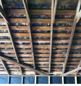
Completed roof interior, condition; Bottom: preserved historic framing & decking remain visible