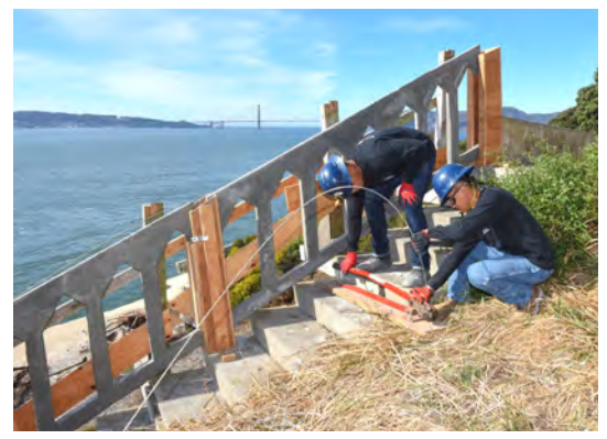
In Progress: Precast concrete panels built offsite, moved & temporarily held in place while team built concrete posts & hand rail in place (Golden Gate Bridge in background)