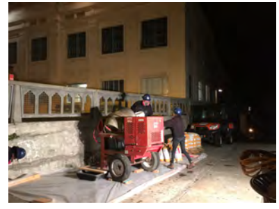
Concrete mixer; repairs completed at night to avoid visitor interruption