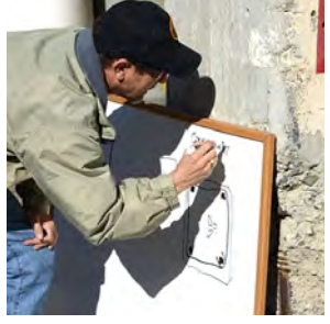
Volunteer structural engineer training team on proper placement of steel reinforcing