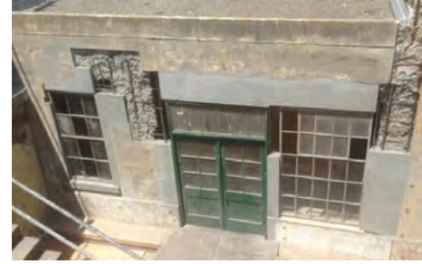
Historic window and doors reinstalled integrally with façade concrete