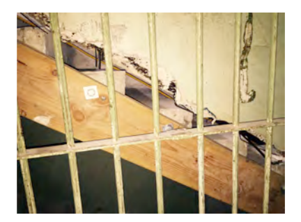
Historic concrete stair treads suspended in place while repairs completed from below