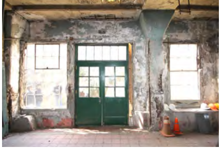
Interior façade existing conditions