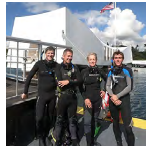
CPI Dive Team