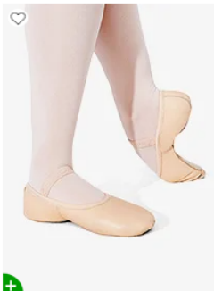
Capezio Girls "Lily" Full Sole Leather Ballet Shoes Gold Price: $22.08