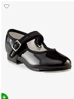
Capezio Child "Mary Jane" Buckle Strap Tap Shoes Gold Price: $44.16