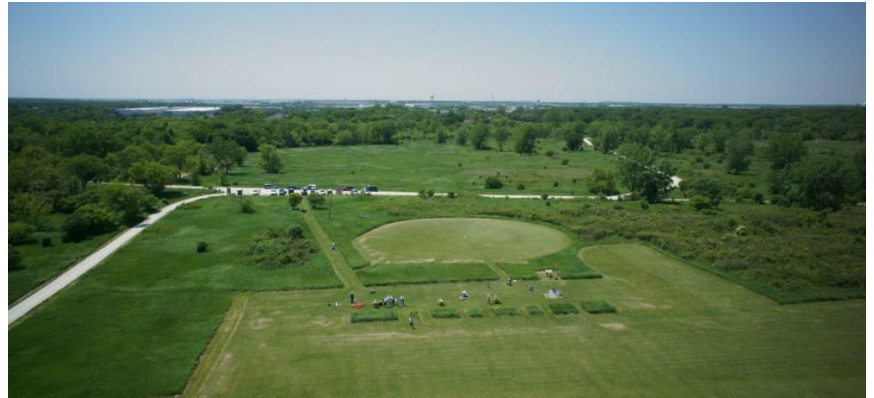
Woodland Aero Modeler's Flying Field at Waterfall Glen Forest Preserve, Lemont, Illinois

Exciting news: our Club received a $75 Club Recognition and Reward Grant from the AMA, thanks to our feature in Downers Grove Magazine as a local “Hidden (see From the Editor next page)