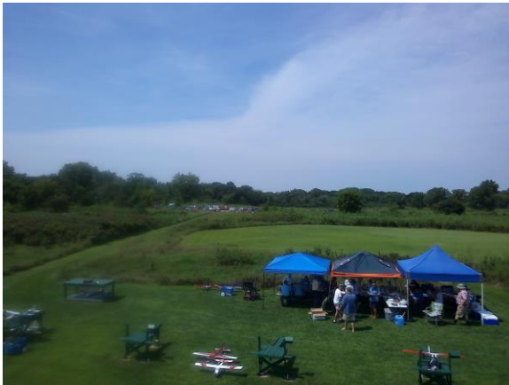
Photo taken with an Exo Fly Ranger Drone.