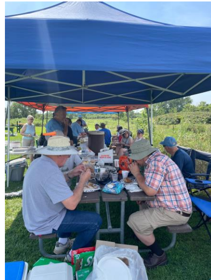
Time to chow down