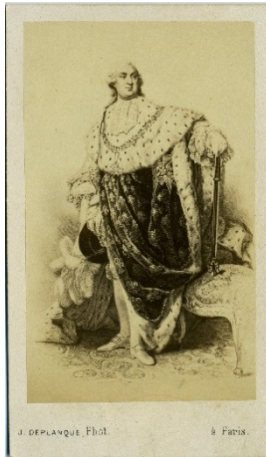
King Louis XVI

From the moment George Washington begins his presidency, global events are about to be dictated by the revolution under way in France.