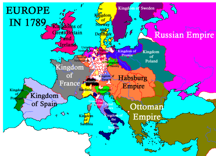
Map of Europe As The French Revolution Begins

Despite this prospect, other European monarchs remain deeply shaken by events in Paris.