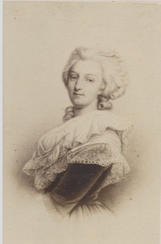
Queen Marie Antoinette (1755-1793)

Having just killed their King and Queen, the French decide to immortalize both through the ancient practice of creating death masks. This involves molding a wet plaster cast over the head of the deceased, allowing it to dry, and then removing and reassembling the front and back into a lifelike representation. The famed “golden death mask” of the 18 year old King Tutankhamen dates the art as far back as the Egyptians.