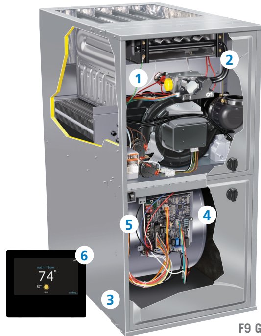
F9 Gas Furnace

Tempstar gas furnaces are designed for durability and comfort. The warmth and efficiency of natural gas combined with a quiet, efficient blower motor delivers comfort throughout the cold seasons. The gas furnace can also be combined with an indoor evaporator coil and properly matched outdoor air conditioner or heat pump to provide cooling during the warm seasons.