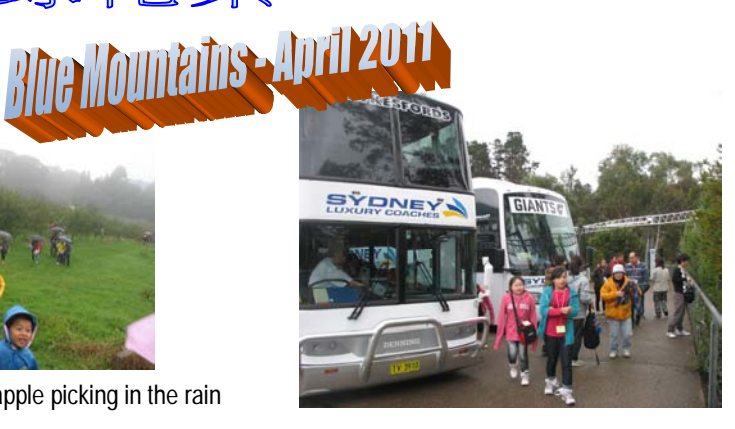
Arriving at Scenic World Blue Mountains