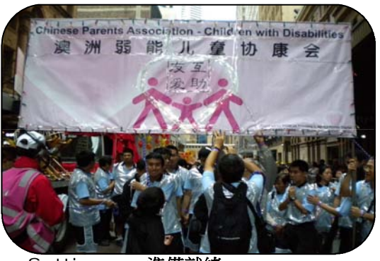
Setting up 準備就緒