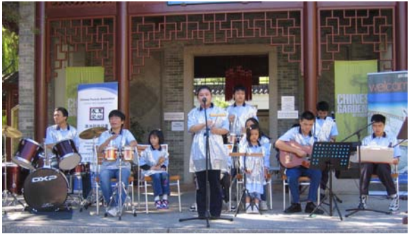
Chinese Cultural Day Performance at Chinese Garden