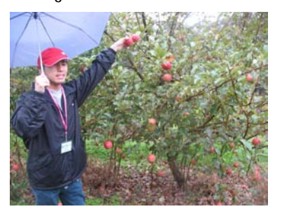
Pine Crest Orchard - apple picking