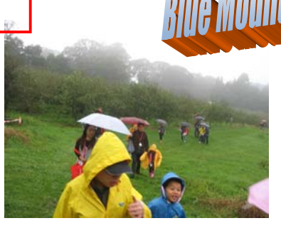
Pine Crest Orchard - apple picking in the rain