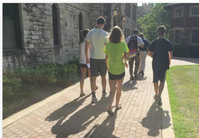
PHS Students at SJNMA