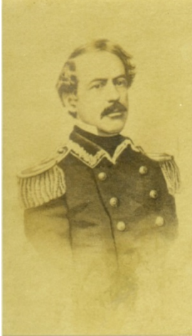
Robert E. Lee (1807-1870)

On March 22 Scott is ready to launch an all-out bombardment from land and sea, but, before beginning, he asks Morales to surrender. When the offer is refused, Scott begins his attack.