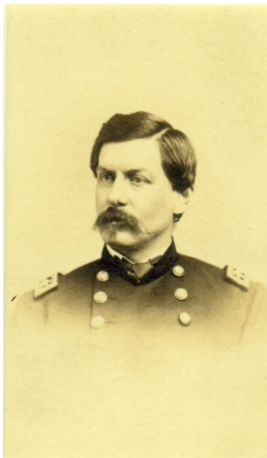
George B. McClellan (1826-1885)

On April 17 Scott divides his army and advances. His light left wing, under Polk's ex-law partner, General Gideon Pillow's, demonstrates against the Mexican forces east of the road, while his main body, comprising Twiggs' and Worth's divisions, swoop down on Santa Anna from behind Cerro Gordo.