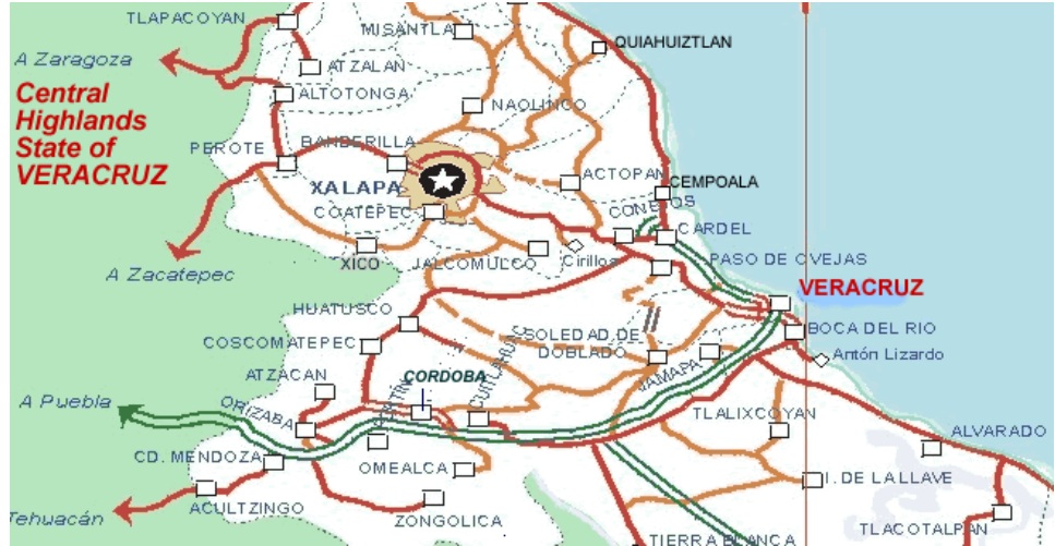
Map Showing City Of Xalapa Where Battle Of Cerro Gordo Occurs

After securing his hold over Veracruz, Scott sends a lead force of 8,500 men out of the city on April 8, heading northwest along the national road, with General David Twiggs and his 2 nd Division in the lead.