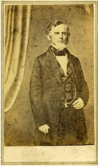
Gideon Pillow (1806-1878)

His losses are steep. Over 1100 Mexicans fall in the battle, and 3000 prisoners are taken, including five general officers. Another substantial depletion in artillery, smaller arms and ammunition also further weakens their capacity to fight on.