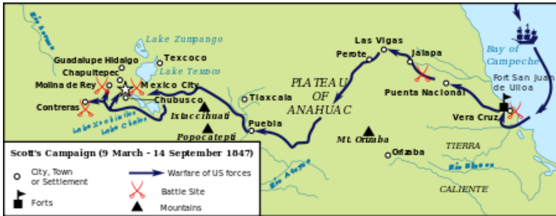
Map Of Winfield Scott's Mexican Campaign

Two weeks after Taylor's victory at Buena Vista, Scott executes America's first major amphibious invasion, landing some 11,000 American troops on Sacrificios Island, just below the fortress city of Veracruz. The operation involves repeated trips ashore by 65 surf boats, each packed with 100 men and equipment, and lasts for over six hours. Once ashore, the men march north to surround the Mexican enclave, which includes 5,000 local civilians in addition to 4,400 garrisoned troops, under General Juan Morales.