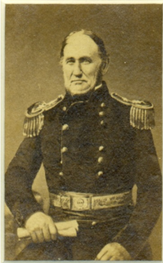
David Twiggs (1790-1862)

After securing his hold over Veracruz, Scott sends a lead force of 8,500 men out of the city on April 8, heading northwest along the national road, with General David Twiggs and his 2 nd Division in the lead.