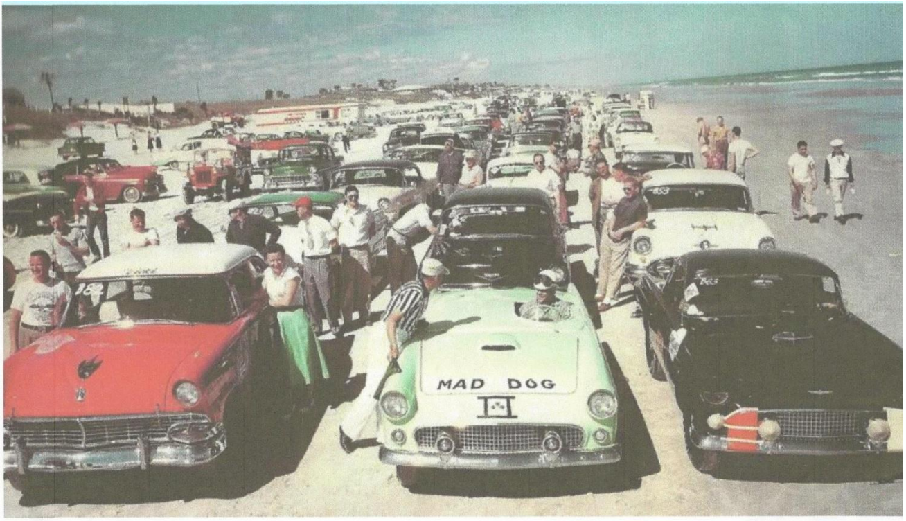
Daytona Beach 1956