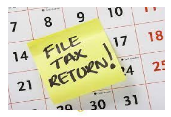
Remember - April 15th