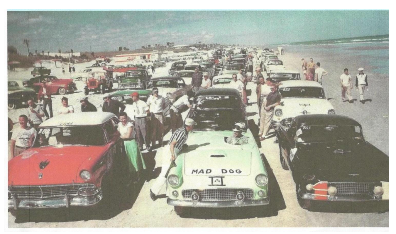
Daytona Beach 1956