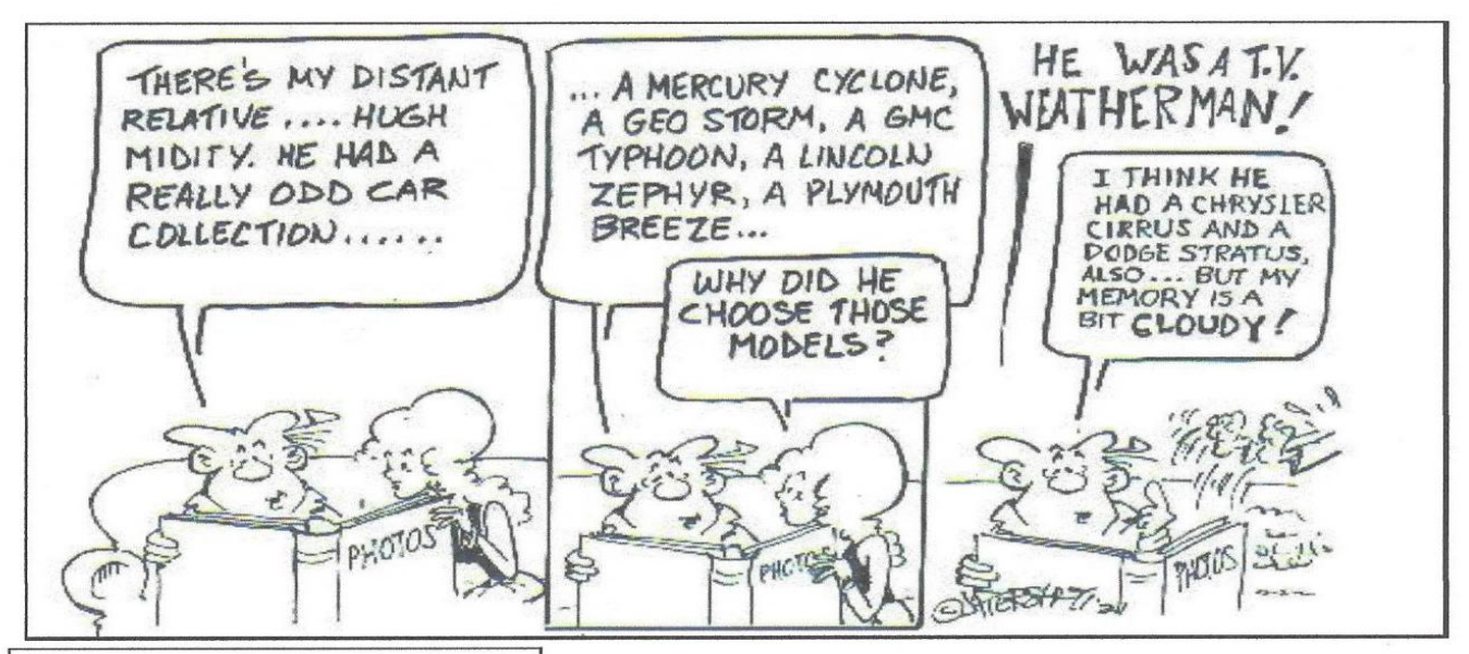
Reprinted from OLD CARS WEEKLY