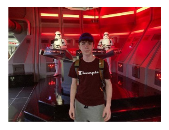
We must have at least 16 Scouts and Adults to Camp at Disney.