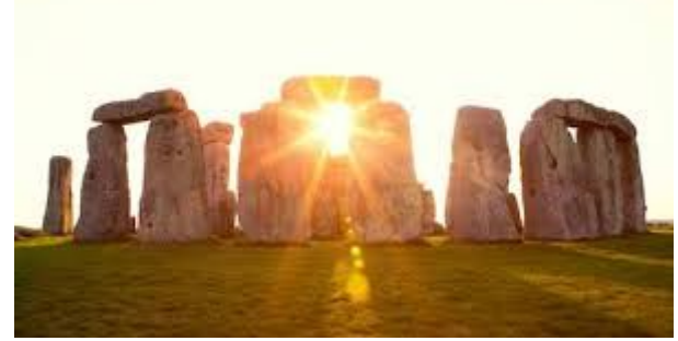
December is the Winter Solstice The days start getting longer. Winter starts