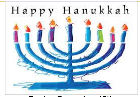
Begins December 12th