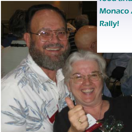
Great friends, food and fun at a Monaco America Rally!