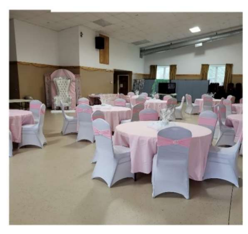
Sweet 16 Party