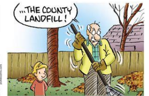
BY BRIAN CRANE