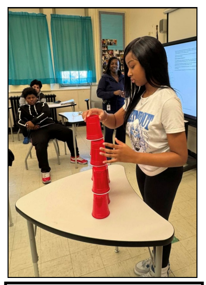
Meet & Greet at a local Jr. HS with Fast Track Students in Illinois.