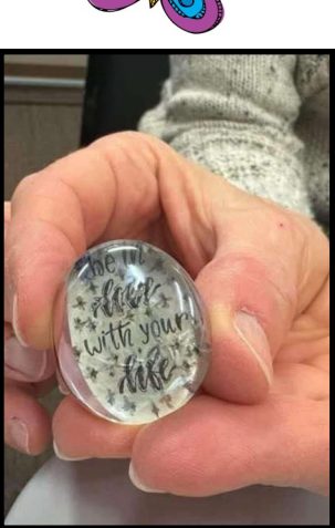
Magnet from Clinton, IA Project Search.

Students in the Project Search self determination program in Clinton, Iowa worked on a mini magnet that reminds them to stay positive!