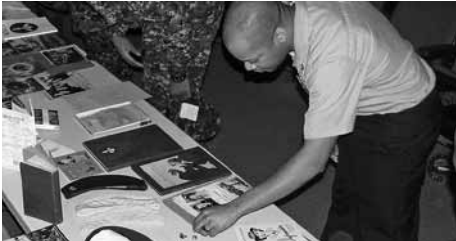
TSC sailors look over display of memorabilia at the Women's History Month presentation.

The Tidewater Tidal WAVES, Unit 152, experienced an exciting month during Women's History Month with nine invitations to talk to the sailors of today "the good old days!" We were so busy that our presentations actually extended into April!