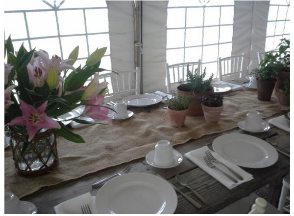
Table setting and decorations for luncheon at Moss Mountain tour

We had a seated and delicious luncheon; the menu included recipes from Smith's latest cookbook, and other cookbook editions.