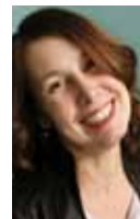
by Leanne Brown

The fair is coming and most Brooklin kids are looking forward to the midway and parade. But there is a lot more for kids to do than just the rides and floats. Kids can even enter some contests and win great prizes.