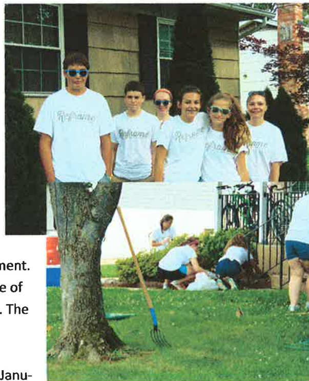
Youth Mission Trip Volunteers from Pennsylvania volunteered at numerous Bay-CSS residential group homes in the Anne Arundel County area during the month of July.