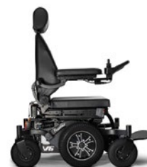
V6 HYBRID - BLACK WHEELS

"WE'VE BEEN CREATING CUSTOM MADE VEHICLES FOR 22 YEARS, SO THAT YOU CAN LIVE THE LIFE YOU CHOOSE"