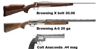
Browning X bolt 30.06

Tickets $50 - 1 Winner 2026 DU Guns of The Year or 1/2 the cash if all 150 tickets not sold