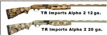
TR Imports Alpha 2 12 ga.

Become a Oak Creek Flyway Chapter Sponsor for $350.00 and be entered to win: