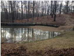
After clean up, Old Costly Mill re-leveled, sand added, and filled with water leaving a nice wide area to flag suitable for Beg Nov/Novice.