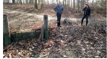
The Old Costly Mill, prior to clean up was ruddy on the bottom and had a rotting stump, but much potential is here.