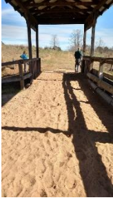
The bridge on the original water complex with new sand.