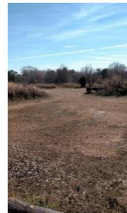
Resurfacing/regrading removed weeds and grass leading to clear ideas of how to use this space for any level XC course.