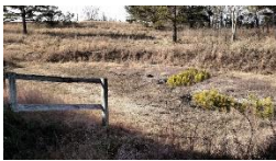
Before renovation began. Pine trees were growing in a ditch in the left side of the original water fence.

Indeed, the horse park came forward and began working on the original water obstacle fence. 20 years since the '96 Olympics, it now had trees growing out of the middle of it. The Park removed them, resurfaced the area, and laid sand over the bridge. They did the same with the Old Costly Mill. Both fences have the capability to hold water as well have several options of navigating through that is suitable for even the Starter division through Novice.