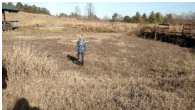
The right side of the fence shows much potential but needs some TLC.