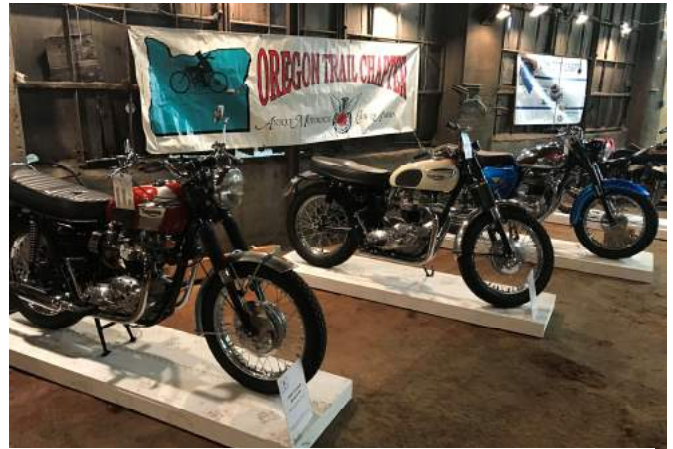
OTC banner and member bikes had a prime location on the first floor