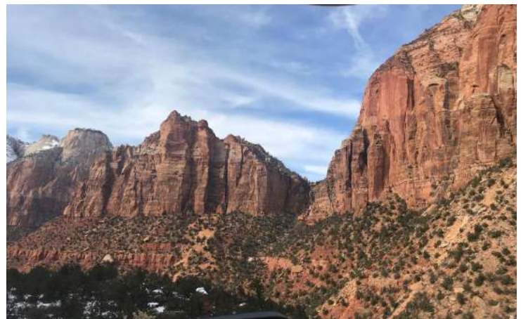
This month's newsletter was produced on a laptop in our camper at 3,900 feet at Zion National Park. This photo has little to do with antique motorcycles, but shows one of the many beautiful views and is a great destination for a motorcycle tour.