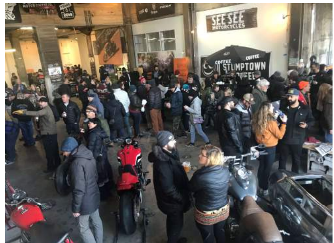
Some of the 18,000 visitors to the One Show