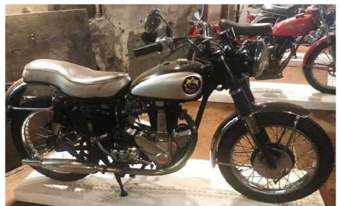
Chuck Hodson's 1959 BSA B-33