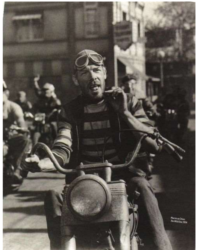
Lee Marvin on a Harley-Davidson from movie The Wild One .