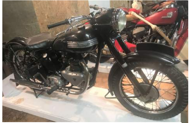
Nils Olson's 1950 Triumph 3T Deluxe, all original/paint