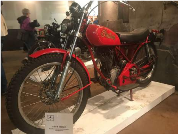
Chuck Hodson's 1914 Indian, modified