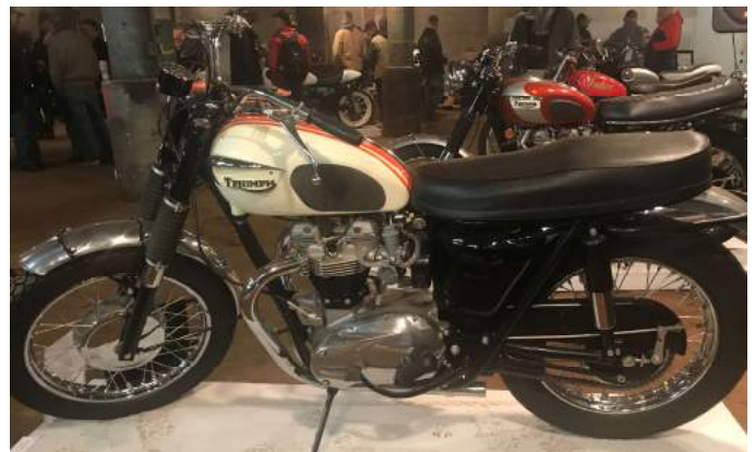
Tom Ruttan's 1966 Triumph Bonneville TT Special, factory race bike