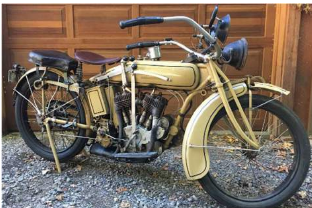
Vahan Dinihanian's 1918 Indian