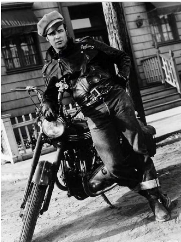
Marlon Brando used his own personal Triumph Thunderbird 6T for the movie The Wild One .