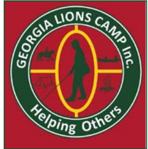
Georgia Lions Camp Inc., Helping Others

Social media helped solve this need and one of our local churches, Emanuel Baptist from Blackshear, Georgia came to our rescue. Wow! Some great things have come from Blackshear this year. GOOO Dawgs!!