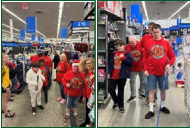
Campers shopping at Walmart

Campers, staff and several volunteers walked thru Walmart with a mission to accomplish. Walmart employees were very helpful and the customers who saw us asked what was going on. We all wore our camp Christmas shirts so we kind of stood out a bit. This let the community know how we as Lions give back where we can.