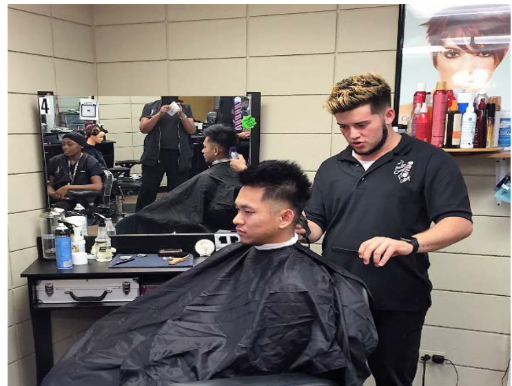
Hands on Training