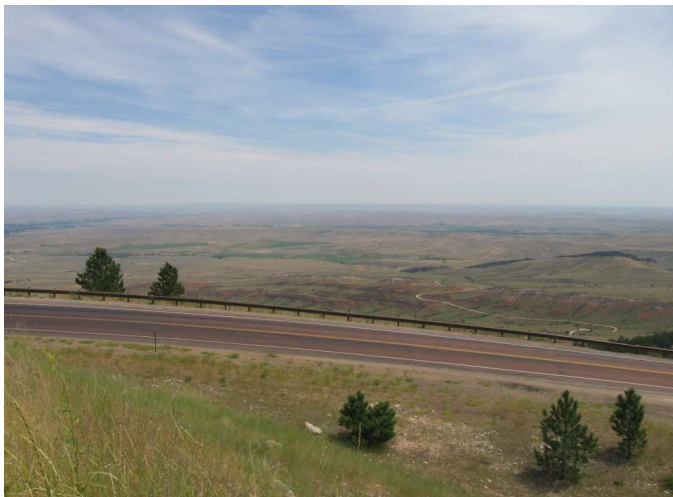
1/2 way Up