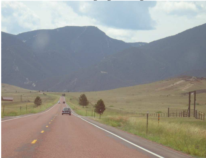
Yes-we climbed this