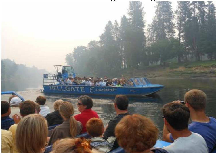
6th stop - river boat cruise