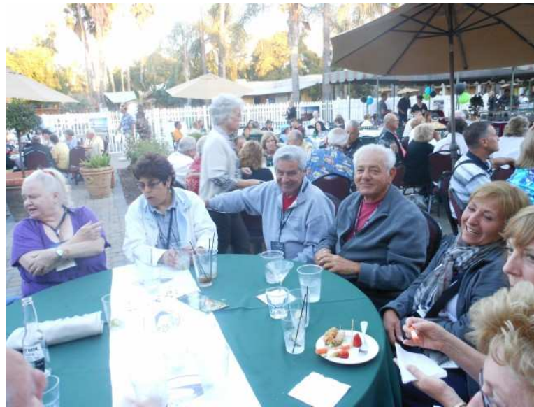
San Jose-Welcome reception