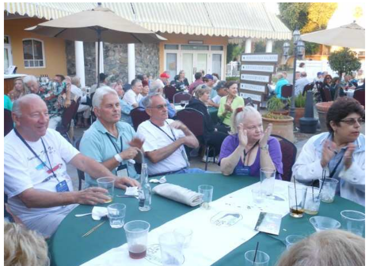
I got you to San Jose - next month additional pictures from the trip