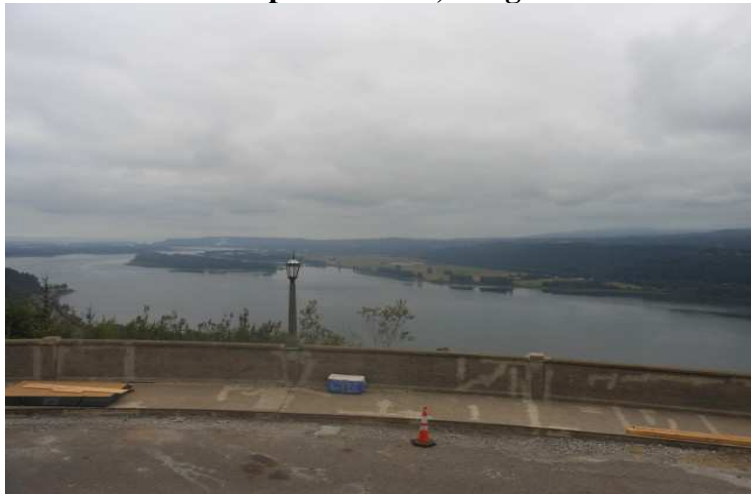
5th stop - Vista House (didn't get a pic of the "house") Columbia River Gorge in background