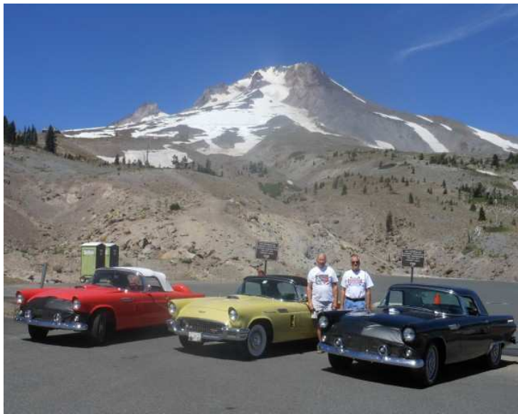
4th Stop - Mt Hood, Oregon