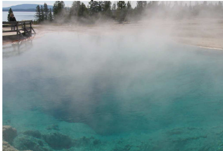
Yellowstone - Hot Springs