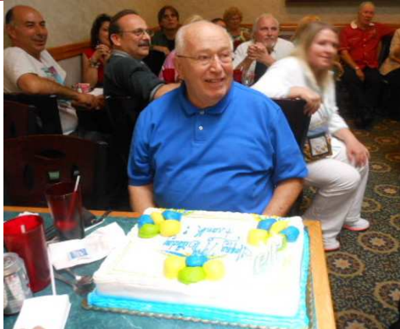
Frank's Birthday was the same day