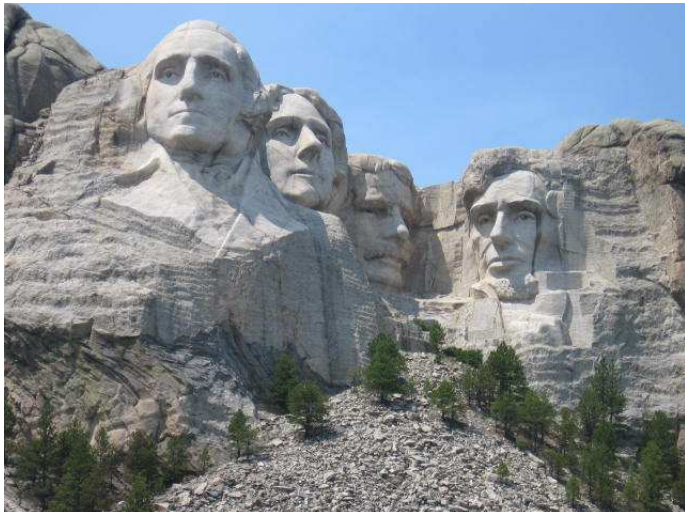
1st stop - Mt Rushmore