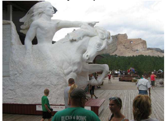
Museum rendering - finished statue