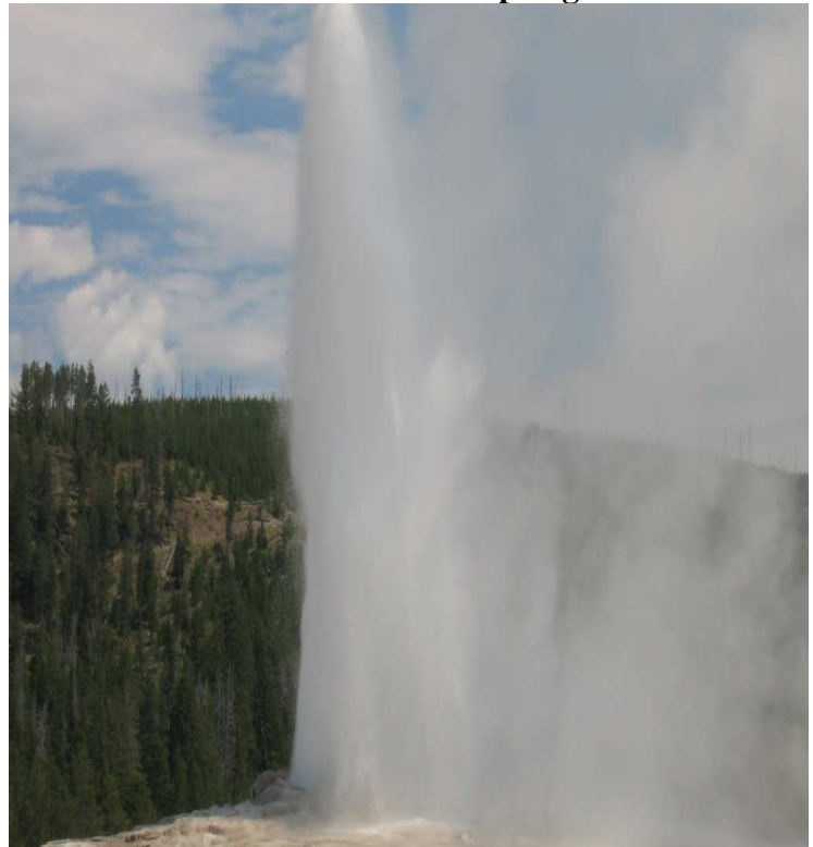
Old Faithful Geyser