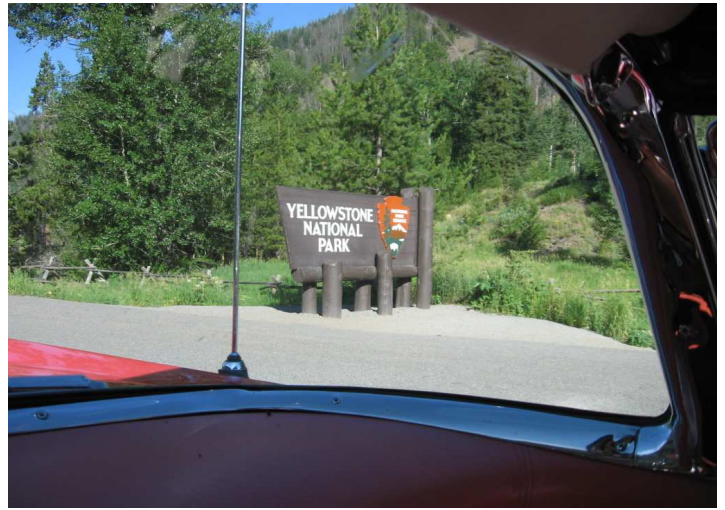
3rd Stop - Yellowstone