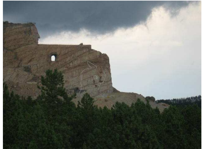
Second stop - Crazy Horse Statue