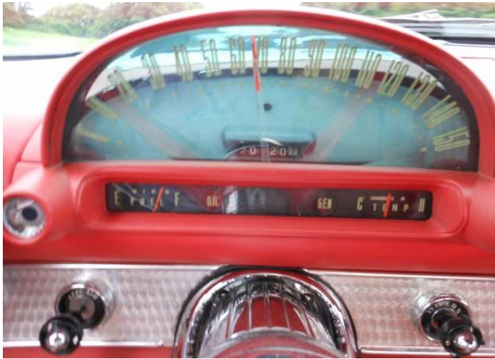
moving right along