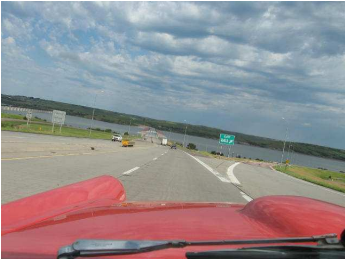
On the road

Two weeks after I got home (probably less than 50 miles after getting home) the heater control doohickey on the intake (I modified mine so it was just a water conduit) started leaking terribly. Talk about good luck. Below are pics I took on the trip. Walter and Bill also took some which I hope to include in later editions of the newsletter