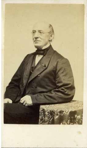
William Lloyd Garrison (1805-1879)

In 1828 a chance meeting at a Boston boardinghouse between two fiery newspapermen and moralists changes the future trajectory of the abolition movement.