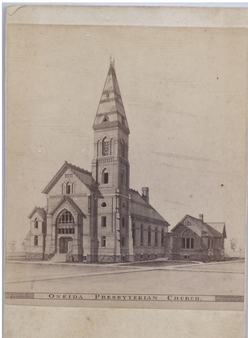
Oneida Colony Presbyterian Church

As the revivalist spirit of Reverend Charles Grandison Finney builds momentum, it captures three converts in upstate New York who commit to reversing the horrors of slavery – Theodore Dwight Weld and the brothers Tappan, Lewis and Arthur.