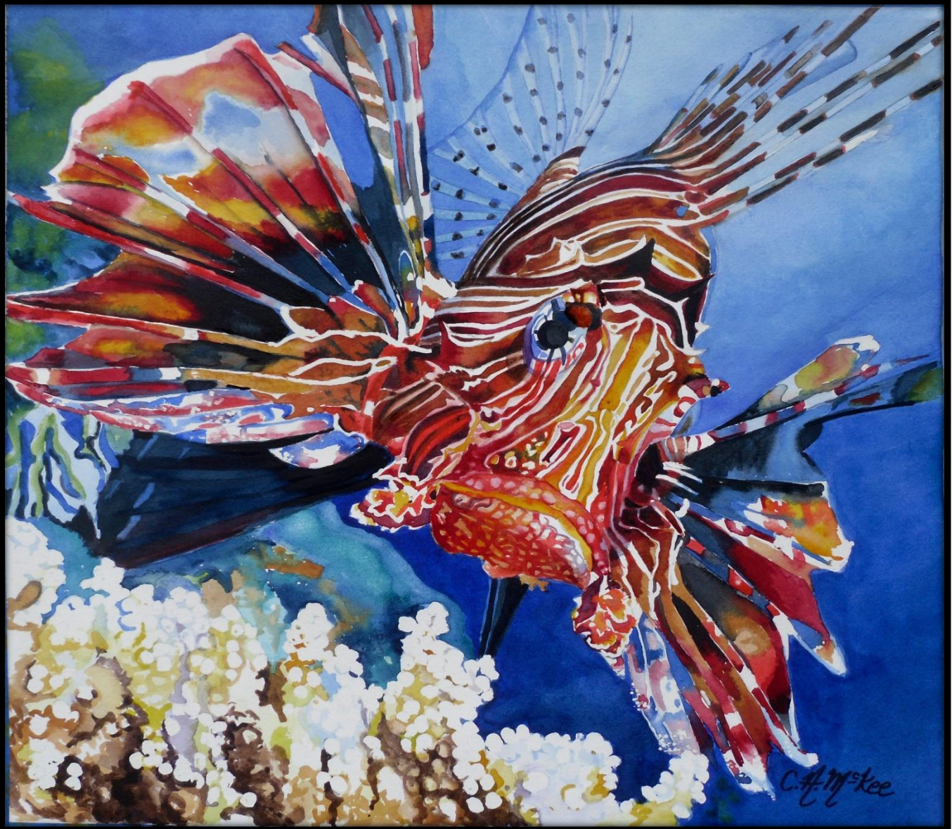
"Red Lionfish"