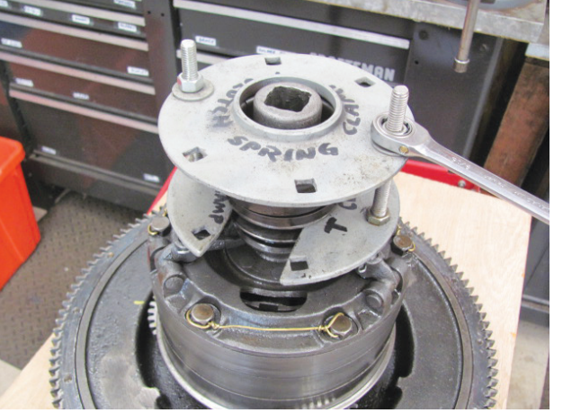
Two scrapped Ford wood wheel hub plates make a handy tool to compress the clutch spring. Notch one to fit into the groove of the clutch shift.