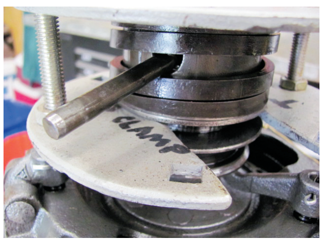
Rotate the spring support to expose the holes and drive the pin out with a drift.

For previous technical articles printed in the Model T Times , visit www.modelt.org and click on "Model T Ford Repair, Service, & Restoration".