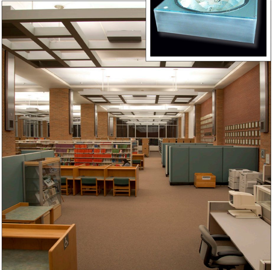
MSU Engineering Library – using only 60 - 420 Watt fixtures for a 50% Energy Savings , they increased light levels from 38 FC to 86 foot-candles.