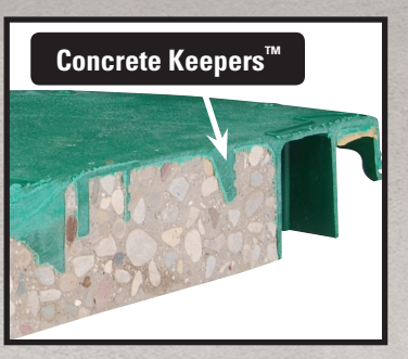
Holds up to 70 lbs of Concrete for Added Safety.