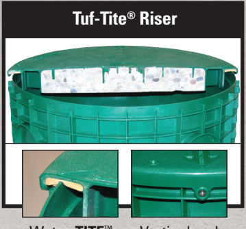
Water-TITE™ Vertical and Horizontal Safety Screws