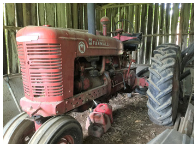
Farmall Super M #97205X1, all new rubber