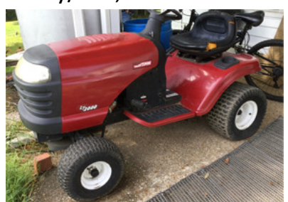
Craftsman LT2000 riding mower