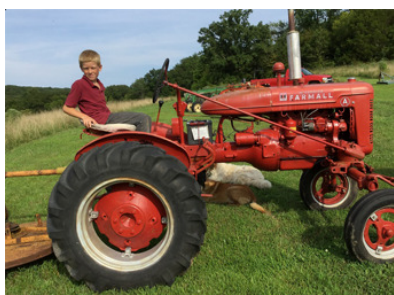
Farmall Super A

Auctioneer's Note: There is a low-water crossing on the driveway, and you must have a 4-wheel drive truck or ATV to cross. No lunch wagon at this sale, so plan accordingly.