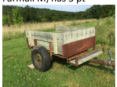
5'x4' Box bed utility trailer