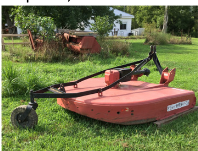
Bush Hog 296 6' cutter, hd, front chains, big gear box