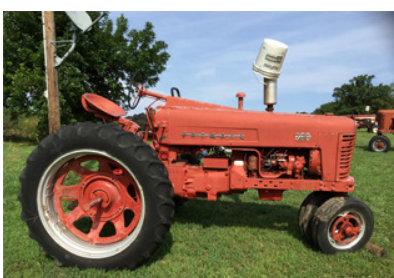
Farmall 300 w/torque amplifier, narrow front