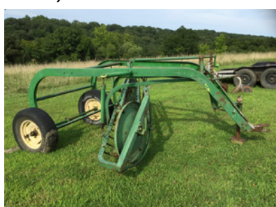
John Deere 894 Rake