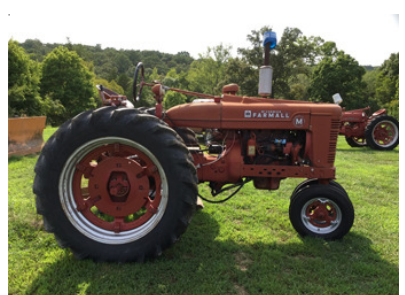
Farmall M, has 3 pt