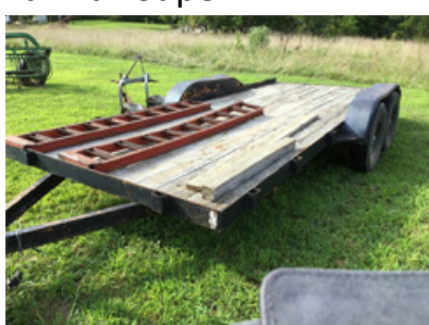
16x6'4" tandem axle flatbed bumper hitch