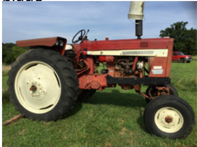
International 544, wide front