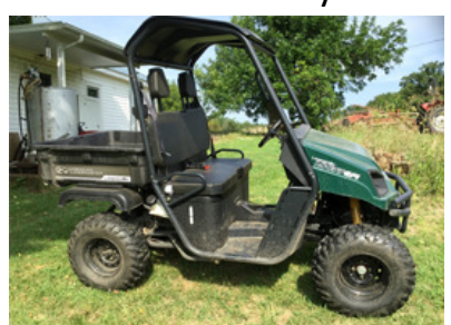
2018 Landstar LS 677 EFI utility/ATV, like new