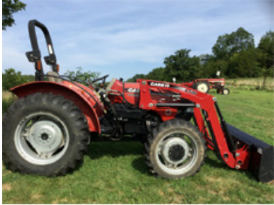
Case IH Farmall 45A, only 458 hours, joy stick, power steer, 4x4, diesel, roll bar, w/Case IH L530 loader