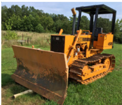
Case 450B crawler/dozer, Good Condition, new undercarriage w/6-way blade