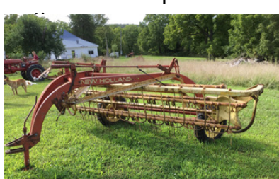
NH Rollabar rake