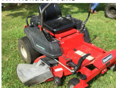
Snapper 360Z 0-turn mower, 48", Kawasaki 21.5 hp, like new