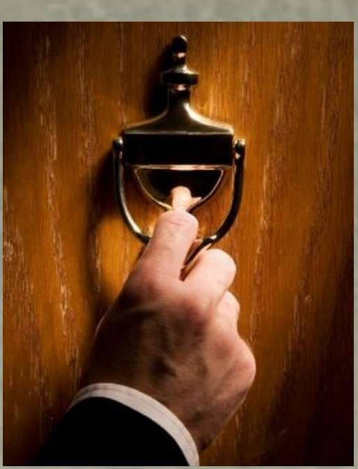
There is much to be said about door-knocking as a form of soul winning. Many times, an entire family can be reached when the person who comes to the door invites in the soul winners. It is often the transfer of the gospel from one family to another. Depending on the neighborhood, you can reach an expanse of socio-economic levels of families from poor to working class to middle class to wealthy.