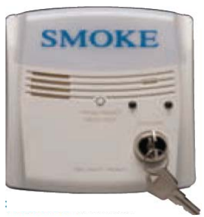
Figure 8 RTS2-AOS UL S2522