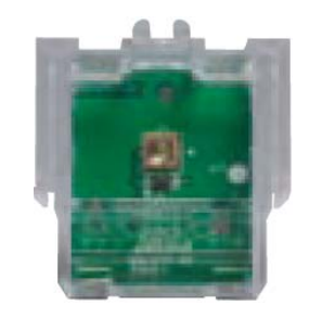
Figure 12 RTS2-AOS with PS24LOW Strobe and PS12/24 LENSW lens