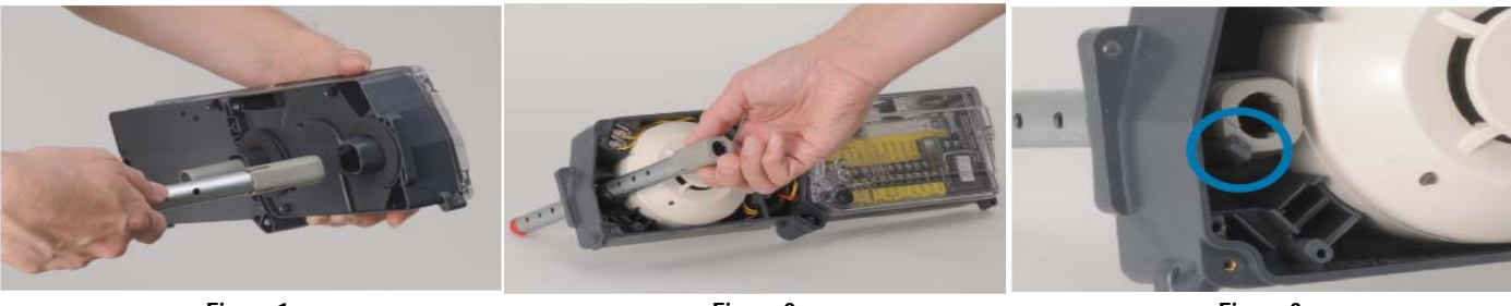
Figure 1 Figure 2 Figure 3

The InnovairFlex sampling tube may be installed from the front or back of the detector. The tube locks securely into place and can be removed by releasing the front or rear locking tab. (Figure 3 illustrates the front locking tab).