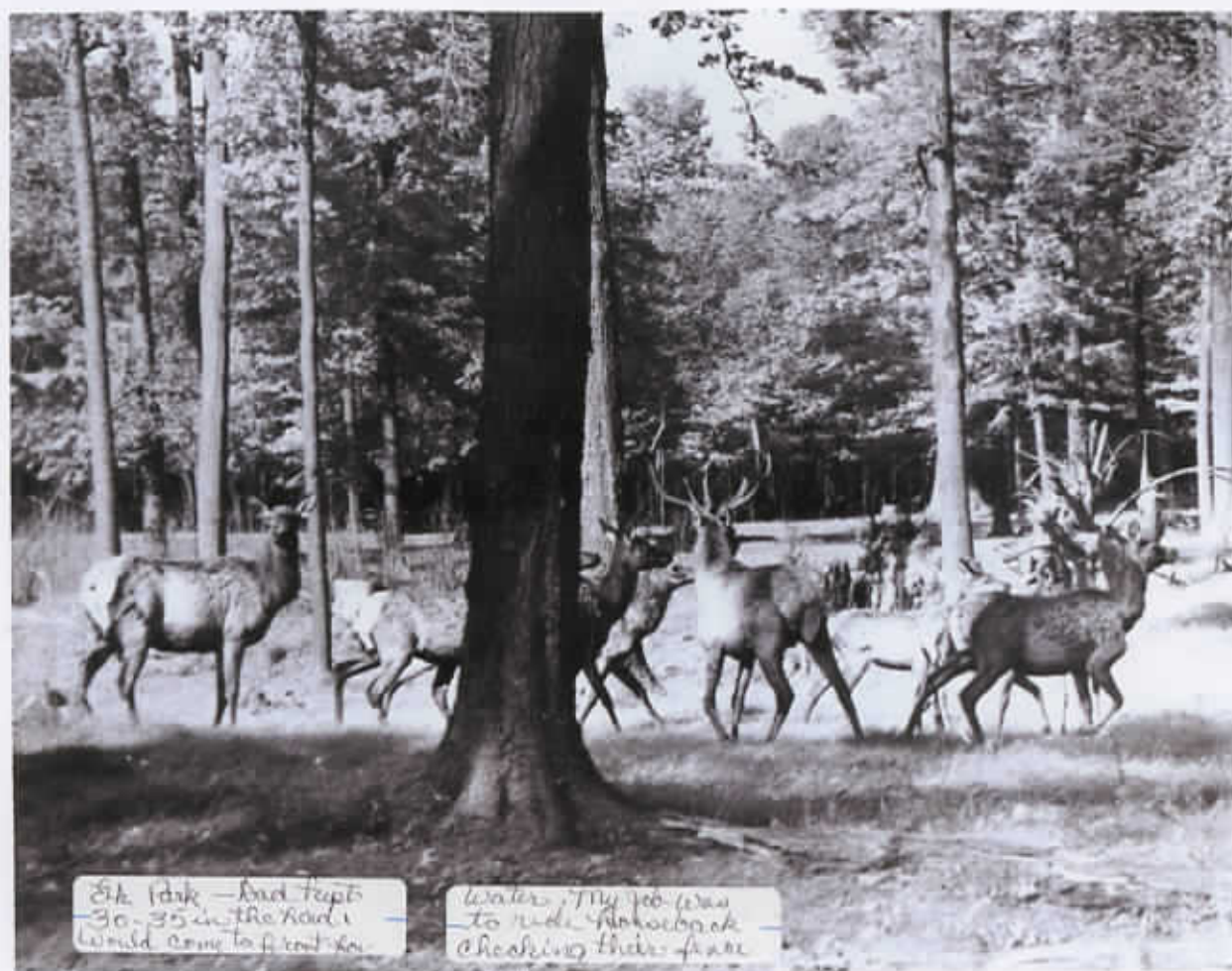
Elk Park - And kept 30-35 in the road would come to a rest for