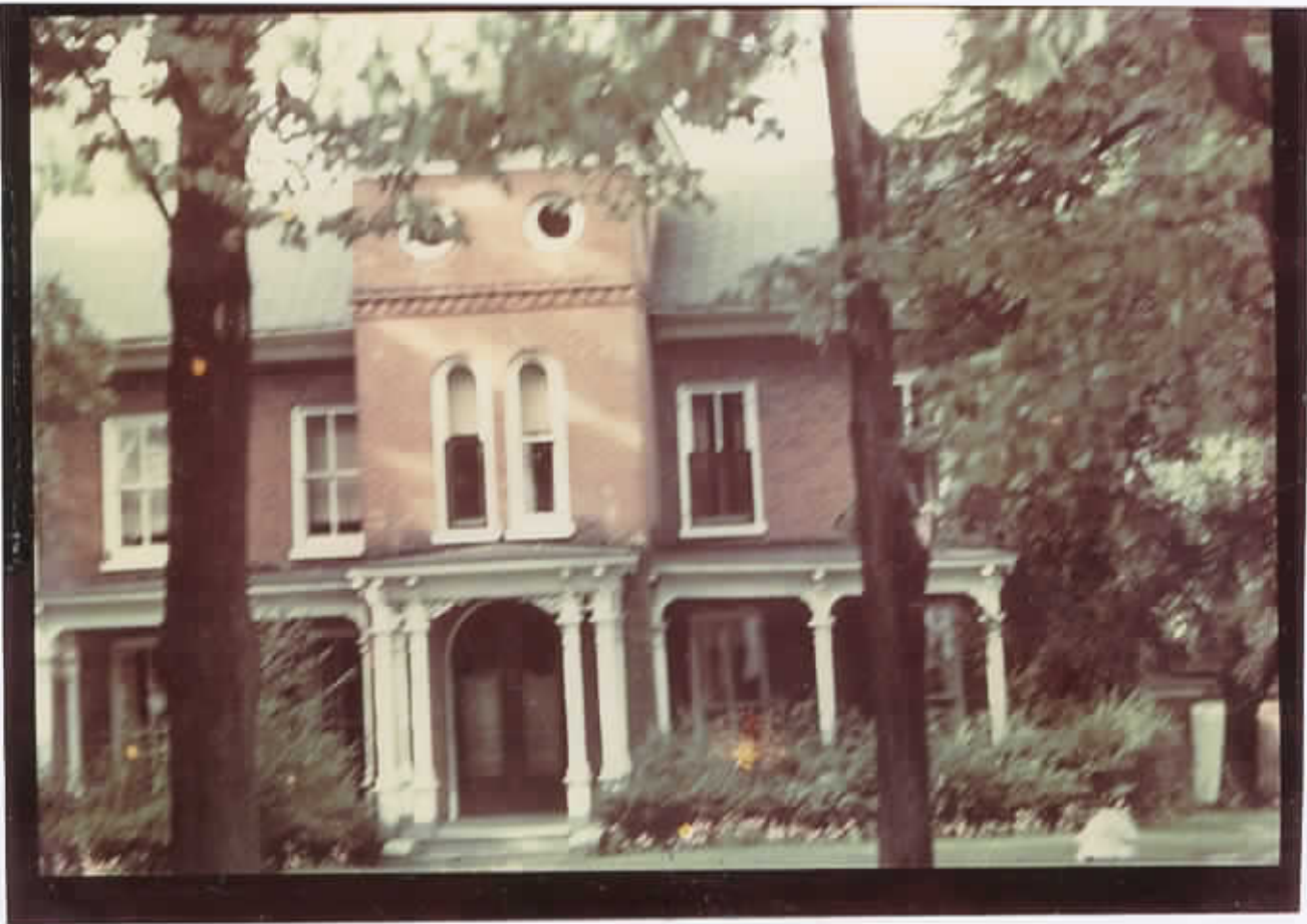
There was a third side of house. - It was on the east - Garage & truck porch on the east - Garage in back.