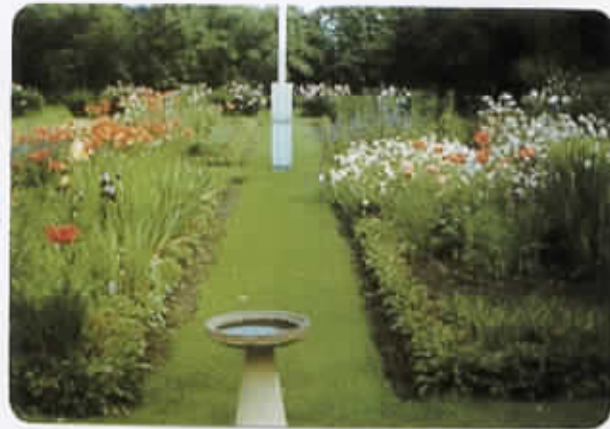
- My mother's garden - Always beautiful -