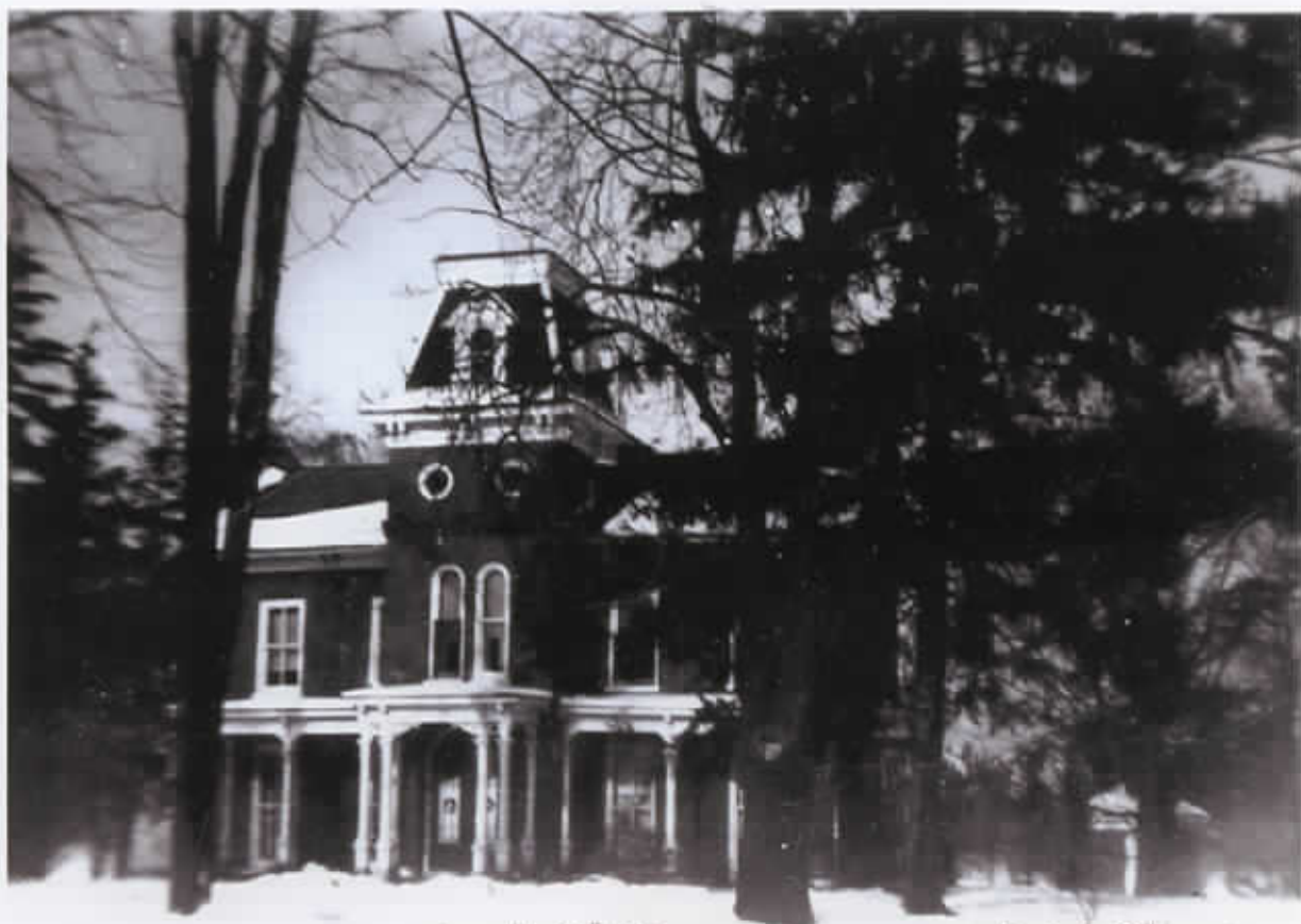
Beautiful Park? My home from birth!