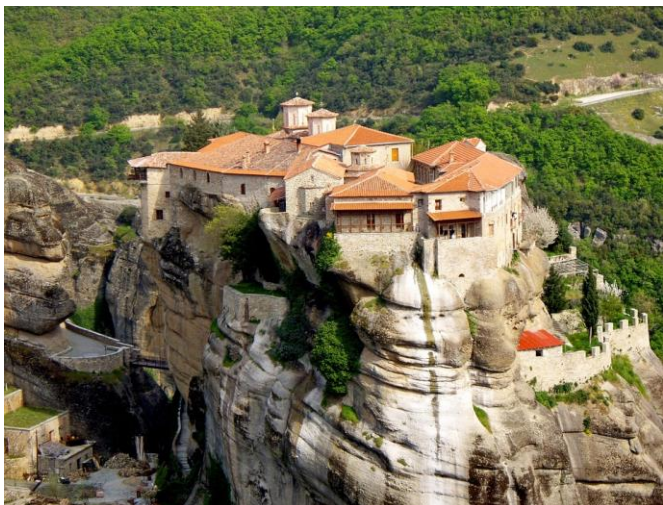
📍 Kalampaka, Greece