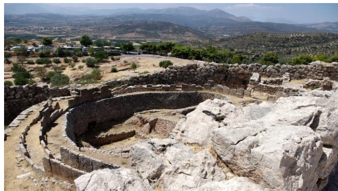
📍 Athens, Greece

Overnight: 5 Star NJV Athens Plaza (or similar) Included meals: Breakfast & Lunch