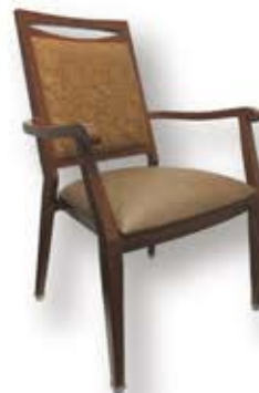
MORGAN (S) 24"W x 24" D x 38.25" H