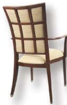
WINSTON (S) 23.5"W x 25" D x 38" H