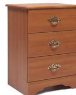
GEORGETOWN COLLECTION $239.00-259.00 EA