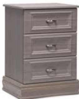
MAGNOLIA COLLECTION $359.00-369.00 EA

*FURNITURE COLLECTIONS - CUSTOMIZE FINISH, COLORS, AND HARDWARE. CALL FOR ADDITIONAL MODELS & OPTIONS.