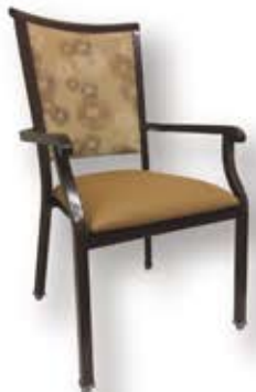
LINCOLN (S) 23"W x 24.5" D x 39" H

LEGEND (S)—STACKS 5 HIGH Ask about Quick Ship Models starting at $229 EA