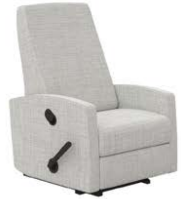
ROCKER RECLINERS 33"W x 34" D x 43" H