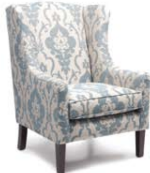
HARPER WING BACK 31"W x 30" D x 42" H