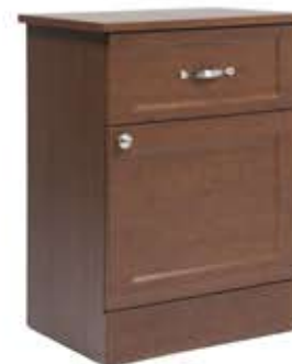
VERANDA COLLECTION $279.00-289.00 EA