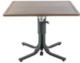
QUICK SHIP 42" SQUARE TOP Spill reducing edge—3 color options