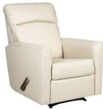
MODEL # 14B 32"W x 36" D x 41" H