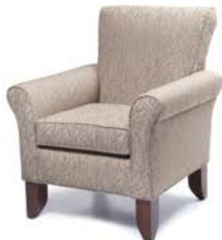
DEIDRE LOUNGE & LOVESEAT 32.5"W (54"W Loveseat) x 33.5" D x 39" H