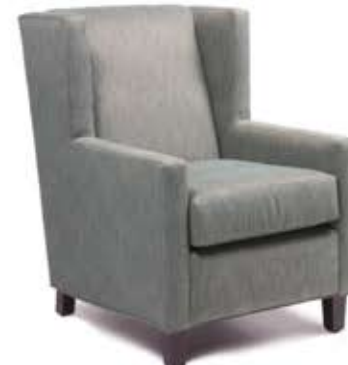
JACOB WING BACK 26.75"W x 33" D x 37.5" H