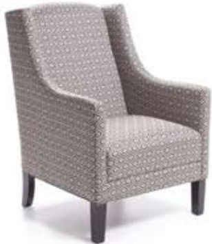
AMBRIA WING BACK 28"W x 32" D x 41" H

Customize fabrics and finishes. Call for additional models and options.