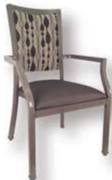
ADAMS (S) 24"W x 24" D x 38" H