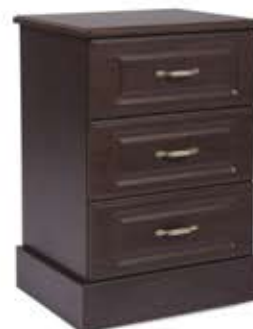
PEACHTREE COLLECTION $259.00-269.00 EA