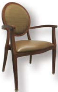
ASTORIA (S) 23.75"W x 23.5" D x 37.5" H