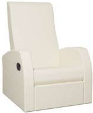
MODEL # 37I 30"W x 36" D x 45" H

Customize your fabrics and finishes. Call for additional models and options. Bariatric models available.