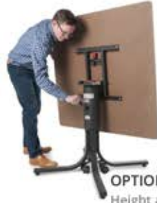
OPTIONAL TILT TOP BASE WITH CASTERS Height adjusts from 26.5" to 32.25"