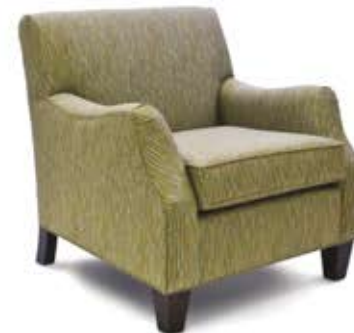
CALVIN LOUNGE & LOVESEAT 31.75"W (54"W Loveseat) x 34" D x 35" H