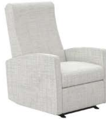
POWER & LIFT RECLINERS 31"W x 34" D x 40" H