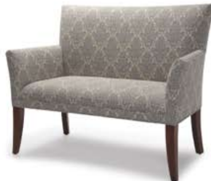
EILEEN LOVESEAT 49"W x 26.5" D x 37.5" H