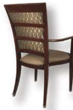
TYLER (S) 24"W x 23.25" D x 38" H