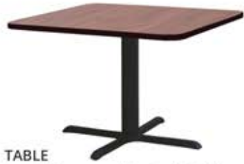
TABLE Round, Square and Rectangle Tables 12 Colors Available

Many sizes and colors options are available. Call for additional models and features.