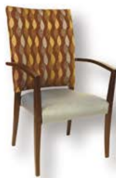
LAVERGNE (S) 24.5"W x 26.75" D x 42" H