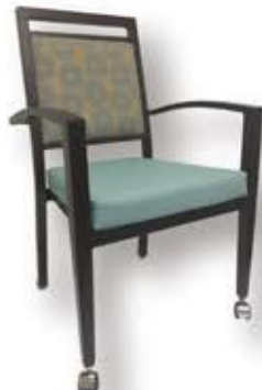
BAXTER (S) 23"W x 23.75" D x 37.5" H