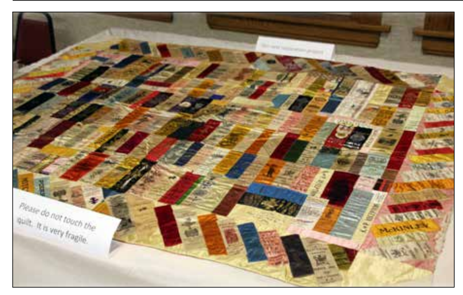
Quilt measures about 4 ½ feet long by 6 ½ wide.