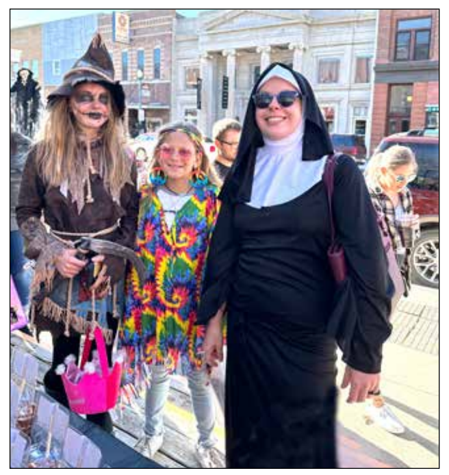
Trick or Treaters having fun downtown at the caramel apple stand.

Hersey Photo Studio captured this 1915 celebration on 2nd and Main in Mitchell, SD. This is the first municipal Christmas tree put up by the city. Businesses located along the street at the time on the west side included Metcalf Clothing and Furniture at 201 Main, Diehl Drug at 209 Main, and the recognizable white columns of the Mitchell National Bank at 217-219 Main. Among others, the east side of the street housed Becker's Clothing at 208-210 Main where the Becker logo can still be seen in the brickwork at the top of the building. The Corn Palace sits in the distance at 5th and Main.