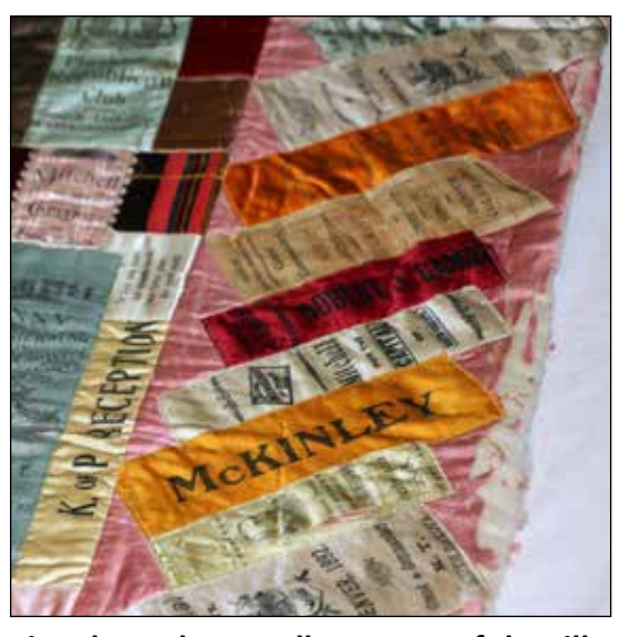
Time has taken a toll on some of the silk ribbons.