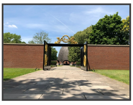
David Lenz Harmonist Period House