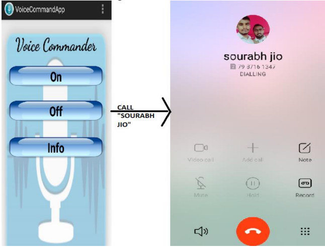
Figure 4: Result obtained after giving voice command "call sourabh jio"