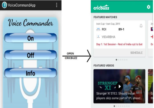
Fig.3: Result obtained after giving voice command "Open Cricbuzz".