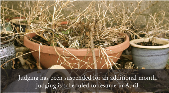
Judging has been suspended for an additional month. Judging is scheduled to resume in April.