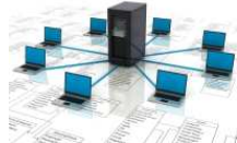
Web Data Analysis & Alarm Log